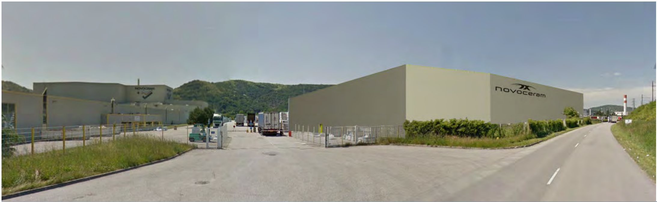
PC6 Insertion paysagère