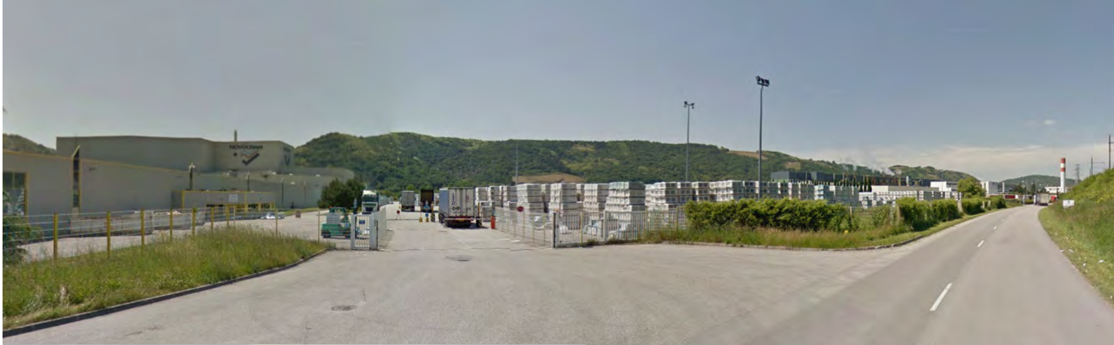
PC7 Photo proche