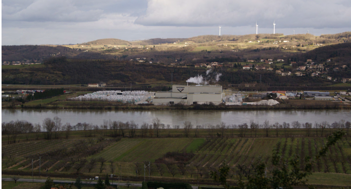
PC8 Photo lointaine